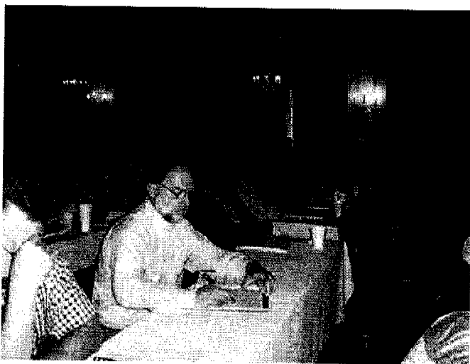
It was a packed house at this year's Seminar and Meeting